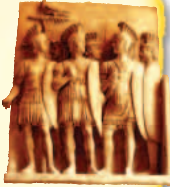
▲ Roman soldiers

"Thus arrayed [decoratively dressed], they entered the city, having at the head of the procession the spoils and trophies and figures representing the captured forts, cities, mountains, rivers, lakes, and seas—everything, in fact, that they had taken. . . . [When] . . . the victorious general arrived at the Roman Forum . . . he rode up to the Capitol. There he performed certain rites and made offerings."