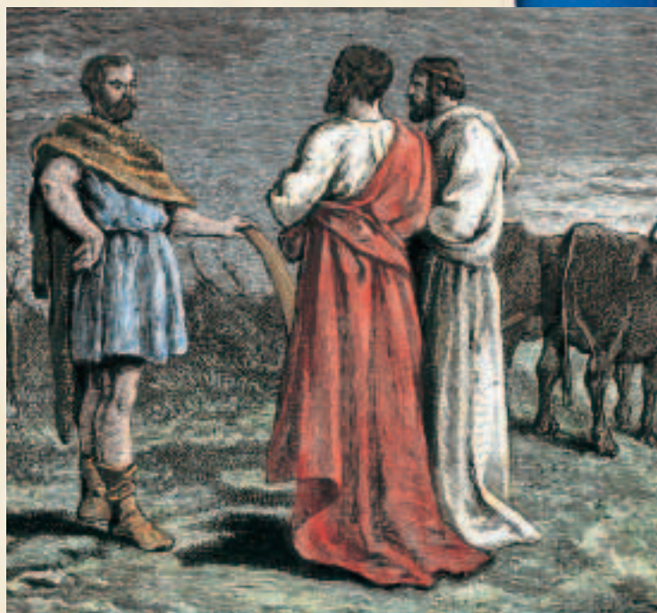
▲ Cincinnatus is asked to lead Rome.

The story of Cincinnatus was important to the ancient Romans for several reasons. He was victorious in battle and quickly gave up the dictatorship. Perhaps more importantly, he did his civic duty by responding to a call to serve.