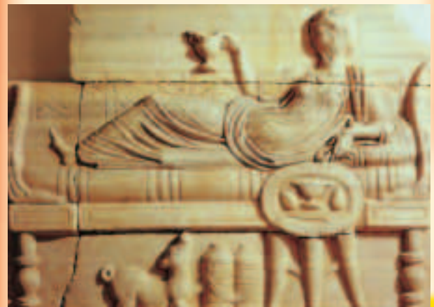
▼ A wealthy Roman woman reclining on a couch

At Roman dinner parties, guests reclined on couches. The enslaved servants served the food, which would be carried into the banquet room on great silver platters. Roman dishes might include boiled stingray garnished with hot raisins; boiled crane with turnips; or roast flamingo cooked with dates, onions, honey, and wine.