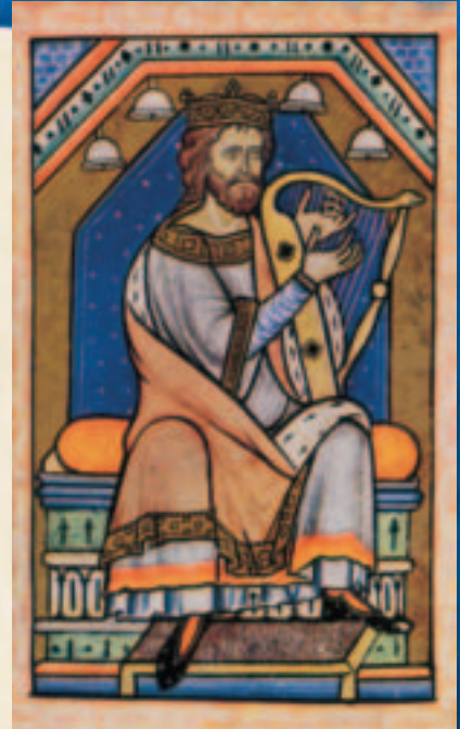
▲ King David

David was not only a brave warrior and successful leader, he was also a talented poet. Many of the hymns in the Hebrew Bible's book of Psalms have been credited to David, including Psalm 23, which begins "The Lord is my shepherd, I shall not want; he makes me lie down in green pastures. He leads me beside still waters; he restores my soul. He leads me in paths of righteousness for his name's sake."