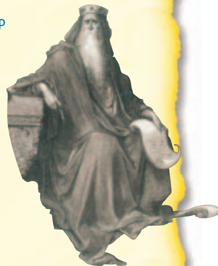
▲ King Solomon